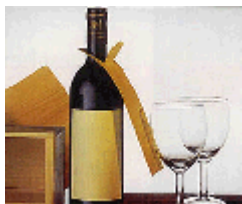
LANDOLIUM Hulshout 0032(0)15/222911