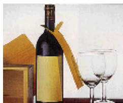
LANDOLIUM Hulshout 0032(0)15/222911