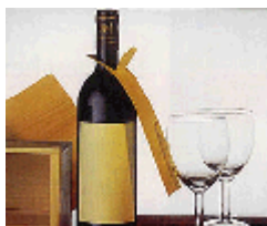
LANDOLIUM Hulshout 0032(0)15/222911